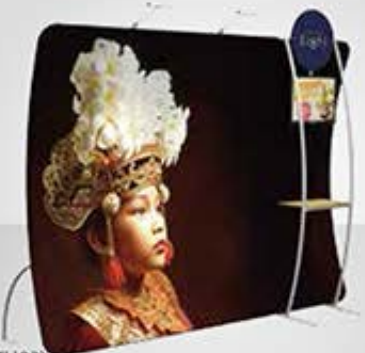
EM-17U02 (E17U03) 10ft U-Shaped Application