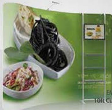
EM-17H01 (E17H01) 10ft Curved Application