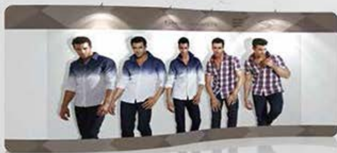
EM-17S (E17U28) 20ft S-Shaped