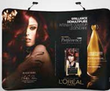
EM-17H (E17U04) 10ft Curved