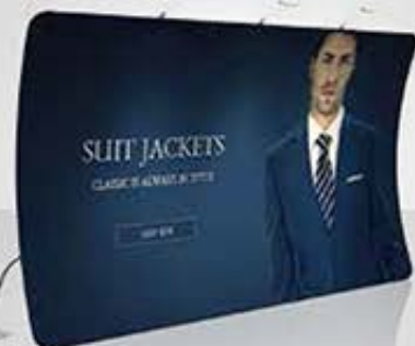
EM-17U (E17U01C) 20ft U-Shaped