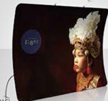
EM-17U (E17U01C) 10ft U-Shaped