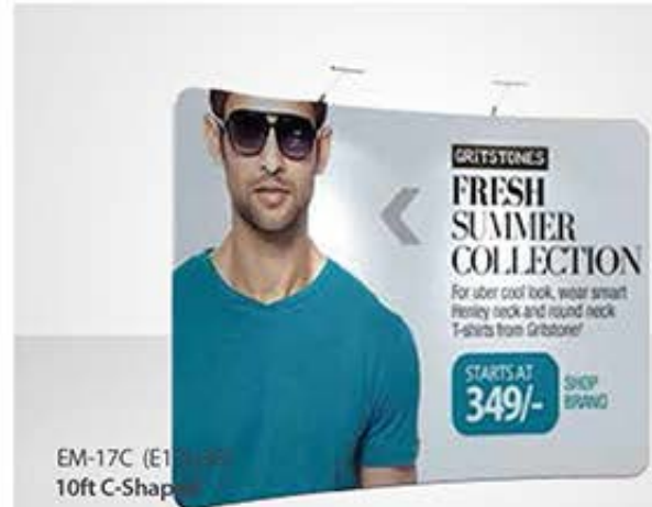
EM-17C (E17U38) 10ft C-Shaped