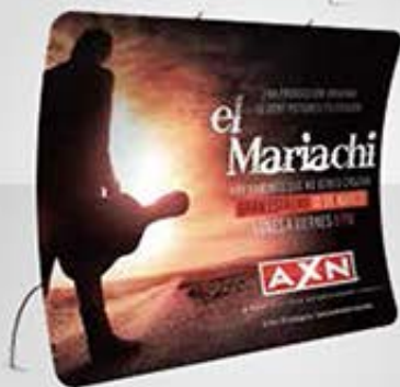
EM-17U 8ft U-Shaped