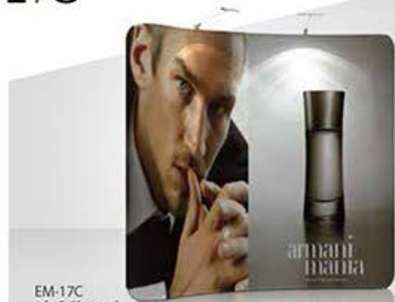
EM-17C 8ft C-Shaped