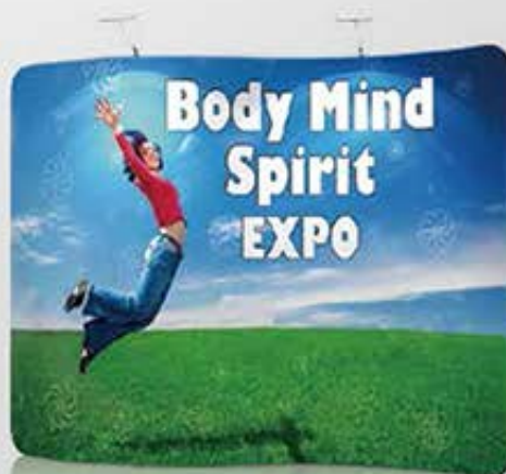
EM-17S (E17U05) 10ft S-Shaped