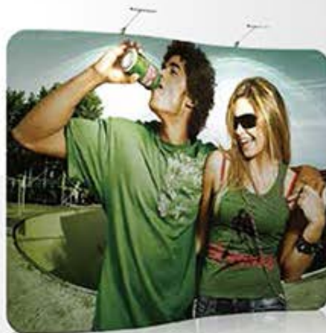
EM-17S (E17U06) 8ft S-Shaped