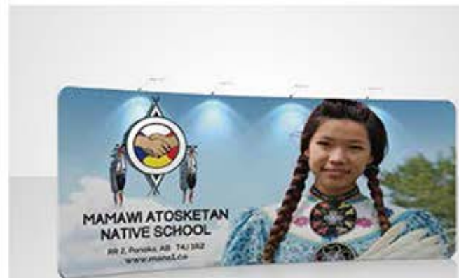
EM-17C (E17U38) 20ft C-Shaped