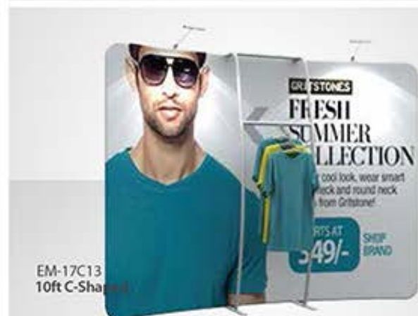
EM-17C13 10ft C-Shaped