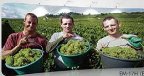
EM-17H (E17U26) 20ft Curved