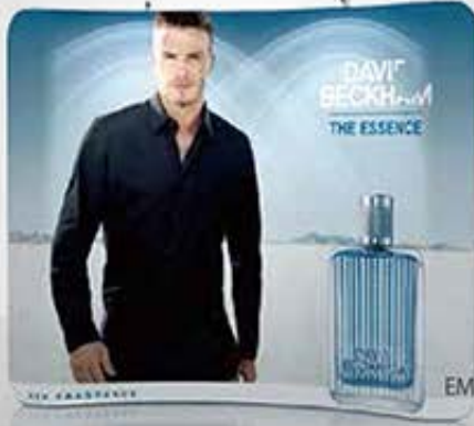
EM-17H (E17U03) 8ft Curved