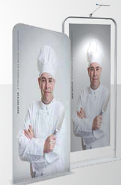
EM-17B1 (E17U36G) 36" Economy EZ tube Banner Stand