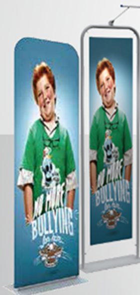
EM-17B1 (E17U36E) 24" Economy EZ tube Banner Stand