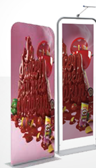
EM-17B1 (E17U36F) 30" Economy EZ tube Banner Stand