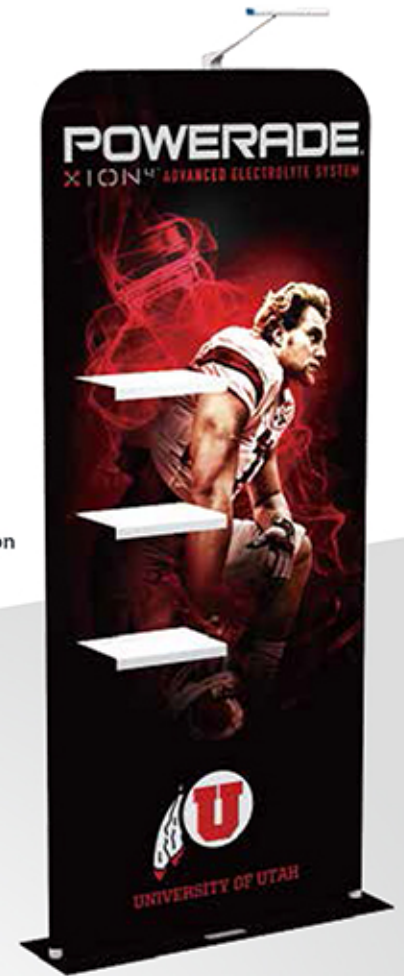
EM-17B3 (E17U36AC) 36" Economy EZ tube Banner Stand Application