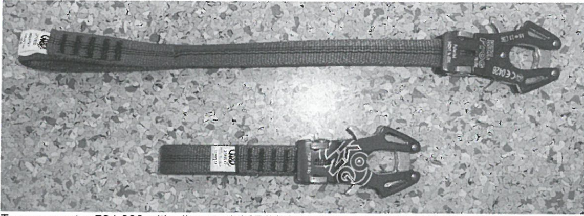
Top: connector 704.000 with sling model 271V00; bottom: connector 704.000 with sling model 27V00

Department: GARTCP / kn Date: 2015-01-22